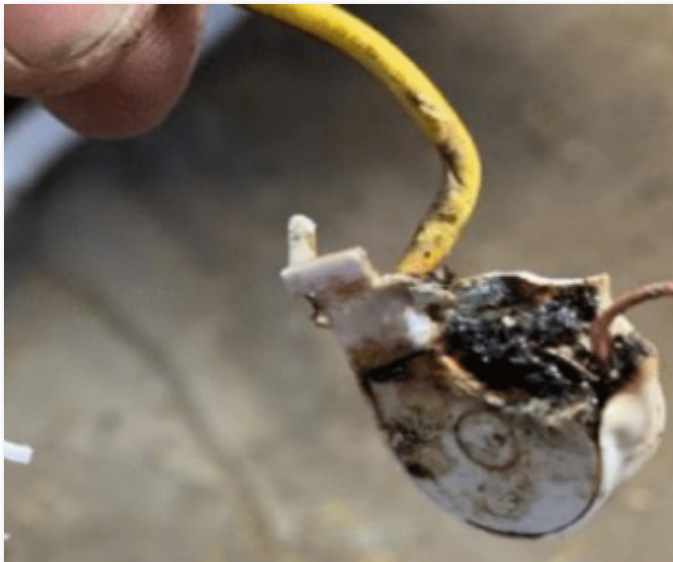
Damaged light connector.