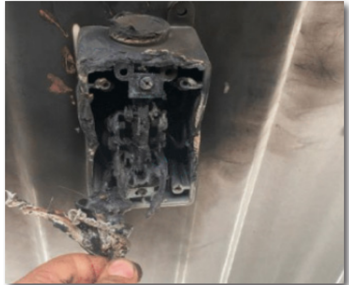
Major fault in an electrical outlet, caused by moisture and corrosion.