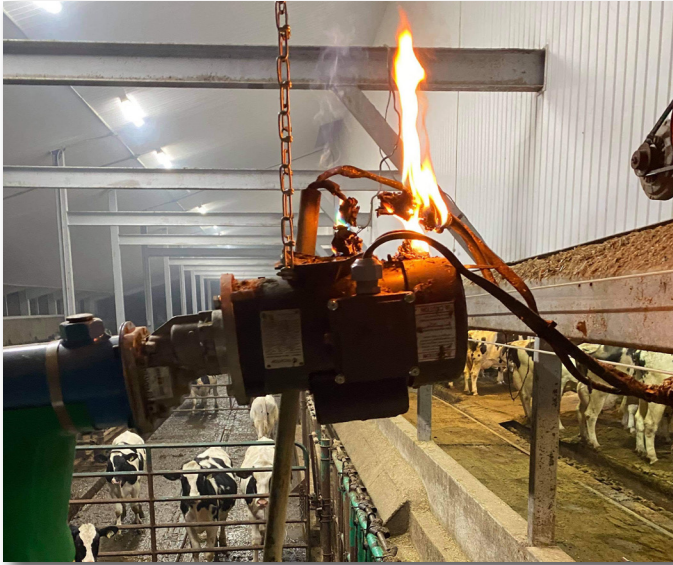
Damage to a cable caused by the vibration of a motor.