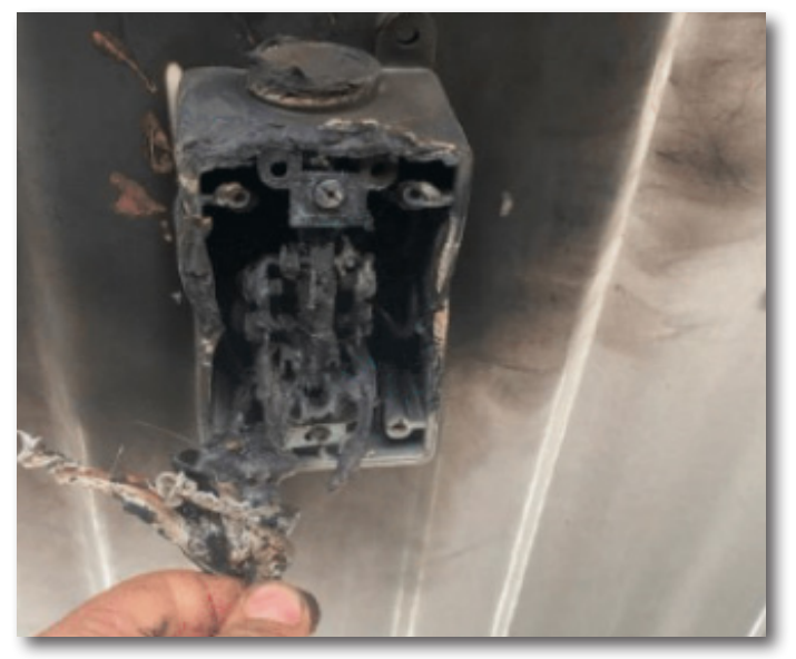
Major fault in an electrical outlet, caused by moisture and corrosion.