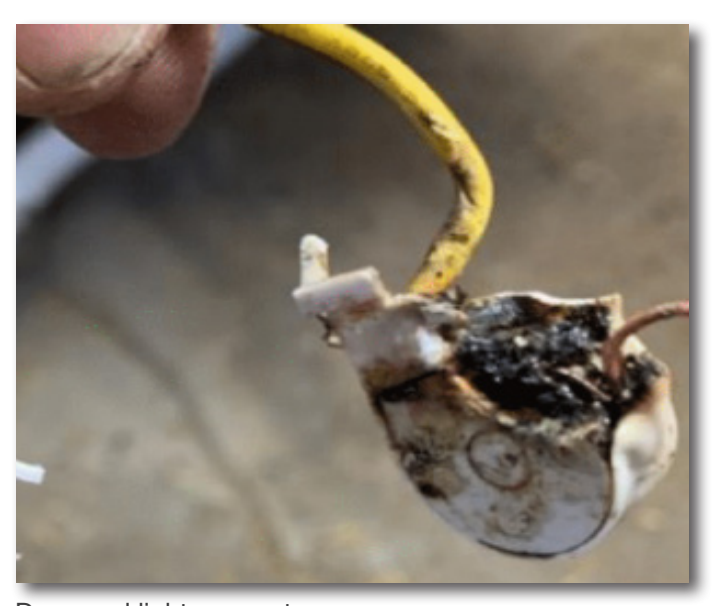
Damaged light connector.