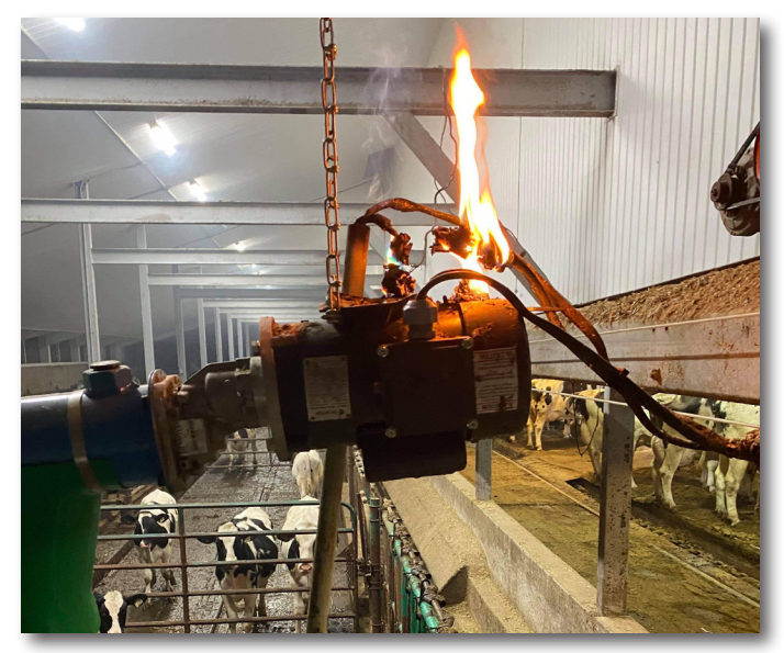
Damage to a cable caused by the vibration of a motor.